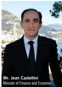
Mr. Jean Castellini Minister of Finance and Economy

In the past, Monaco both prospered and suffered from its reputation as a haven where the wealthy could stow their investments without too many questions being asked, but this is no longer the case. With Prince Albert's encouragement, Monaco's authorities and financial services sector have embraced the international drive for greater transparency and have signed taxation disclosure agreements with many EU member states and others. "People are looking for as much transparency as